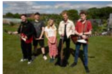
Shipston Introducing winners

Illness caused some unforeseen changes in the programme, for example when the Jolly Rogers, an act at the Coach and Horses during the infamous pub trail, were without their lead singer but encouraged budding vocalists in the audience to fill in instead.