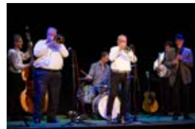
Baby Jools Jazzaholics

Illness caused some unforeseen changes in the programme, for example when the Jolly Rogers, an act at the Coach and Horses during the infamous pub trail, were without their lead singer but encouraged budding vocalists in the audience to fill in instead.