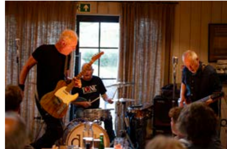
Dirt Road Band

The Proms committee offers a massive thank you to everybody involved in this huge community event: sponsors, fundraisers, artists, venues and festival goers. See you all in 2025!