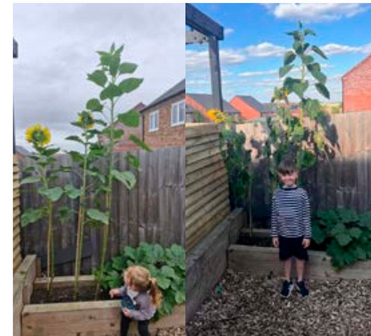
Darragh and Etta Quinn both grew 8ft specimens

'I think it was a lot of luck this year. Usually I grow my sunflowers in the back garden, but this year we put it in a pot in the front garden and the sun helped it grow and it didn't stop. Our neighbours have helped look after it when we've been away, so I've liked having their support. I think I will save the seeds and see if I can grow one even taller next year!'