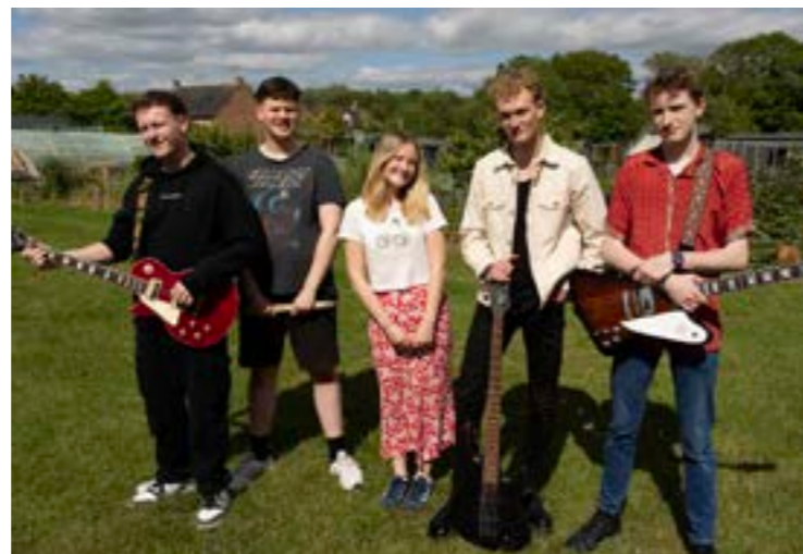
Some of last year's Shipston Introducing winners.