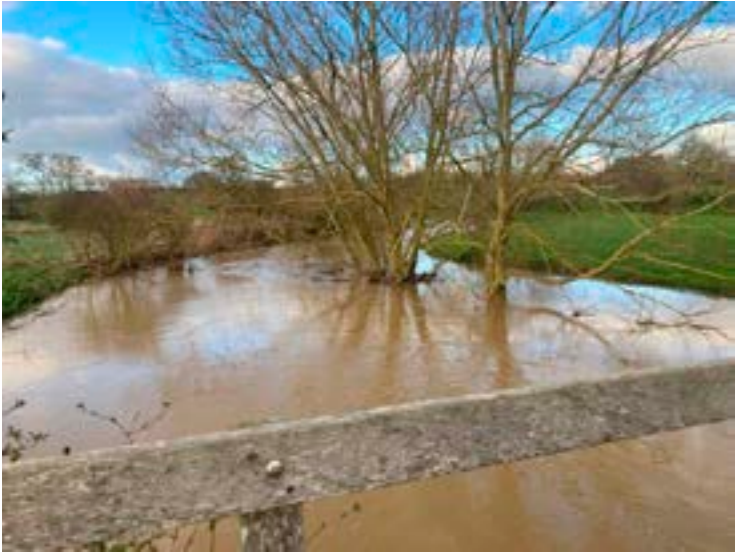
River Stour in flood

As your local Environmental Action group, SAFE is linked with many other pro-active, local and national organisations to share knowledge and resources and support and encourage each other. These are just some that you may have read about: