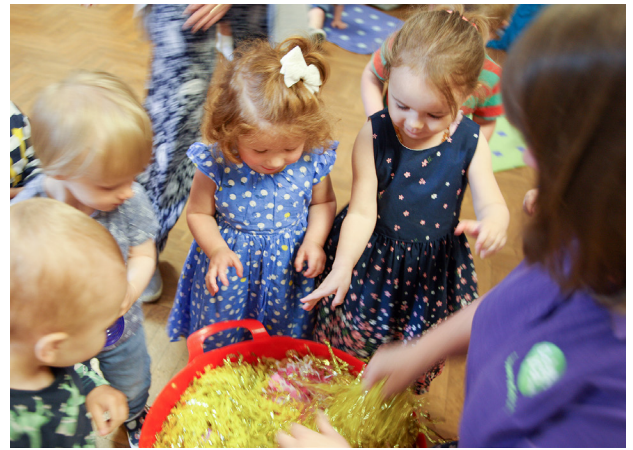
Children enjoying the fun with Calypso Music

Free Sports Fridays will be coming to Long Compton Recreation Ground on 24th August, 11am-3pm. Sessions are free so just turn up and enjoy.