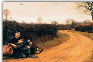
'Hard Times' (detail) by Hubert von Herkomer, 1885. (Manchester Art Gallery)

TUESDAY 25 JANUARY, 2022 2 pm TOWNSEND HALL