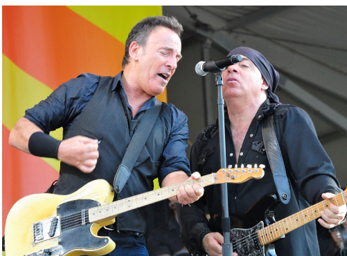
From the mean streets to the E-street...