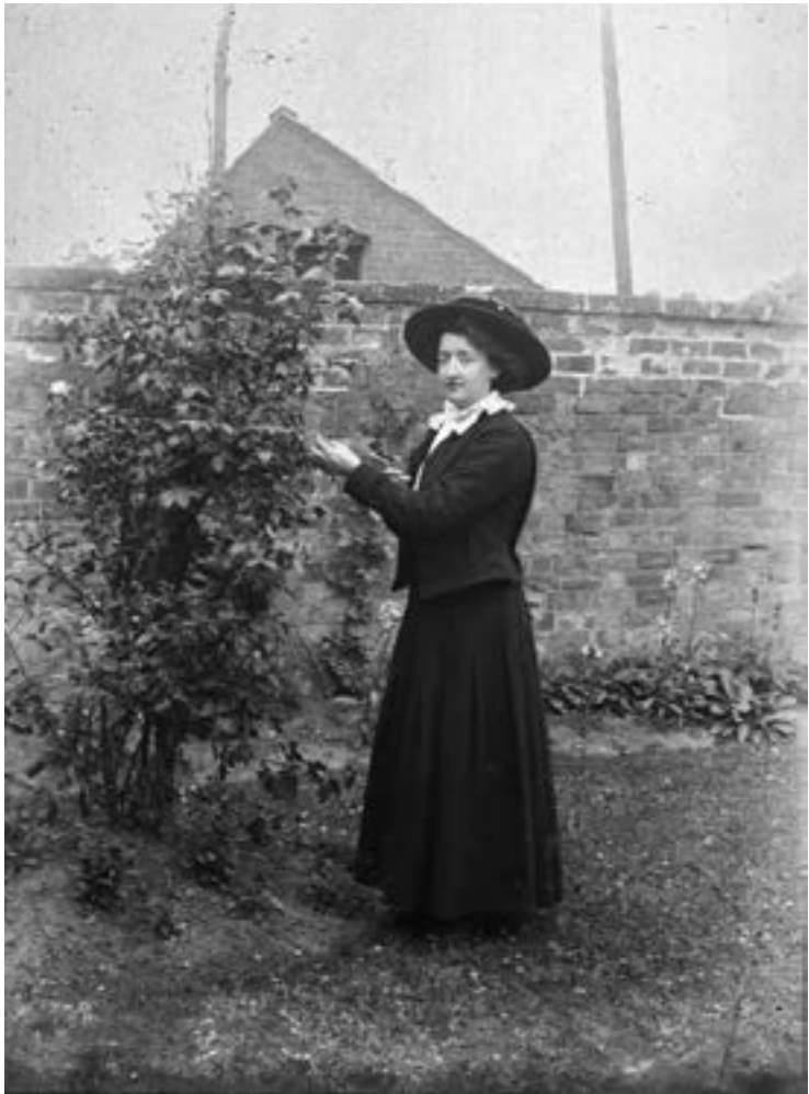
A lady pruning roses, from the Museum's photographic collections. Does anybody know who she is?

Stories like this bring the Museum alive. If you have any tales, memories, pictures to share – or would like to know more about volunteering – please contact via the Shipston On Stour Local History Society Facebook page, email shipstonmuseum@outlook.com or drop a note into the Museum. And put the Easter opening in your diaries!