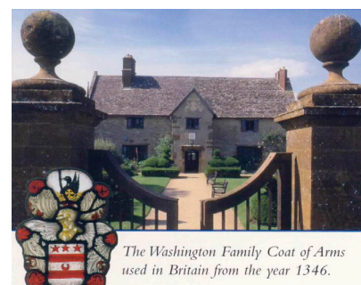
The Washington Family Coat of Arms used in Britain from the year 1346.