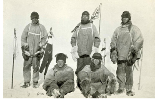
The South Pole party from left to right - Oates, Scott, Bowers, Scott, Wilson, Evans. They reached the Pole on the 18th of January 1912.

Scott, Bowers and Wilson died in their tent in a storm only 11 miles from the depot. Their bodies remain where they died.