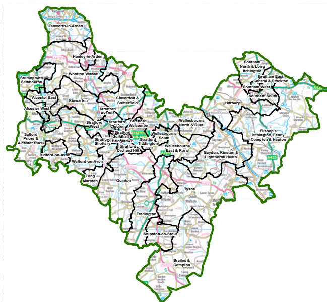
Map of the new boundaries for Stratford-on-Avon District Council proposed by the Local Government Boundary Commission for England.